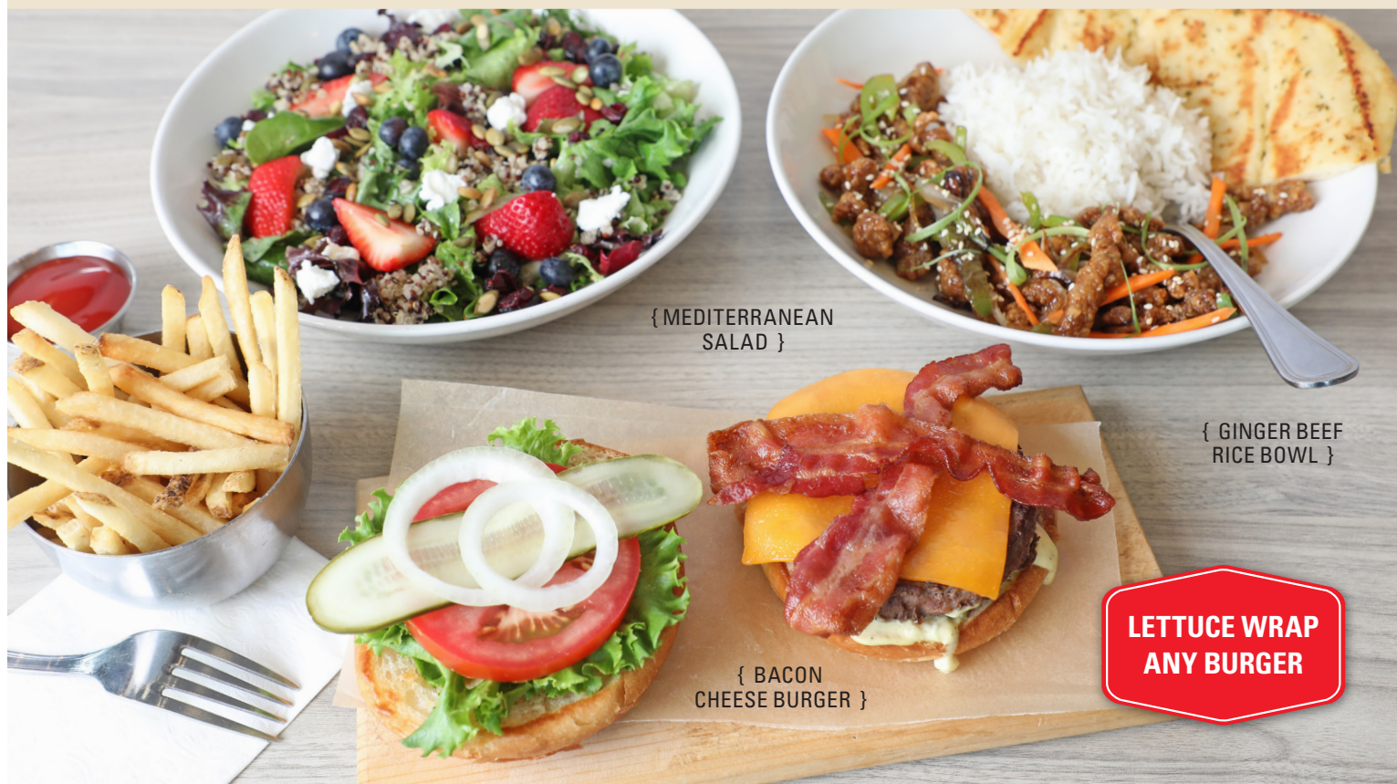
{ MEDITERRANEAN SALAD }

Two warm flour tortillas filled with Cajun blackened chicken, fresh house-made pico de gallo, shredded lettuce, then drizzled with chipotle aioli. 17 99