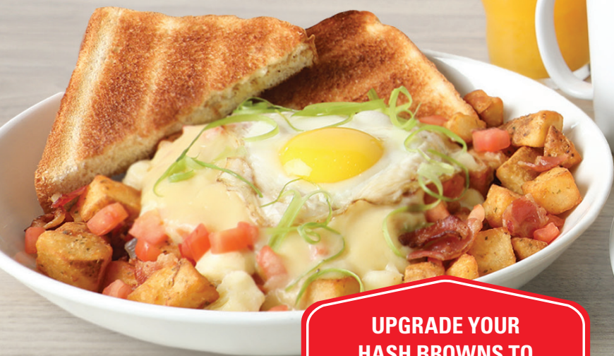
{ ULTIMATE BREAKFAST BOWL }

UPGRADE YOUR HASH BROWNS TO BREAKFAST POUTINE FOR ONLY $3.99