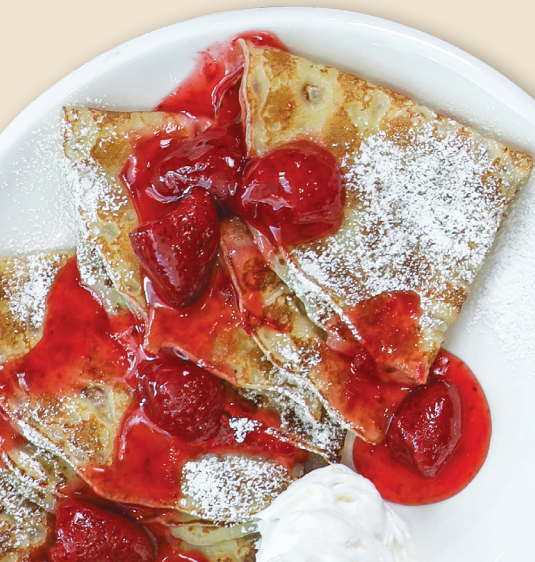
{ STRAWBERRY CRÊPES }

A stack of three of our famous Smitty's™ buttermilk pancakes. 12 99 (V)